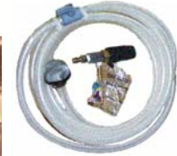
"New - M5" Version"